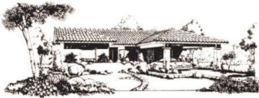
Elev. - B