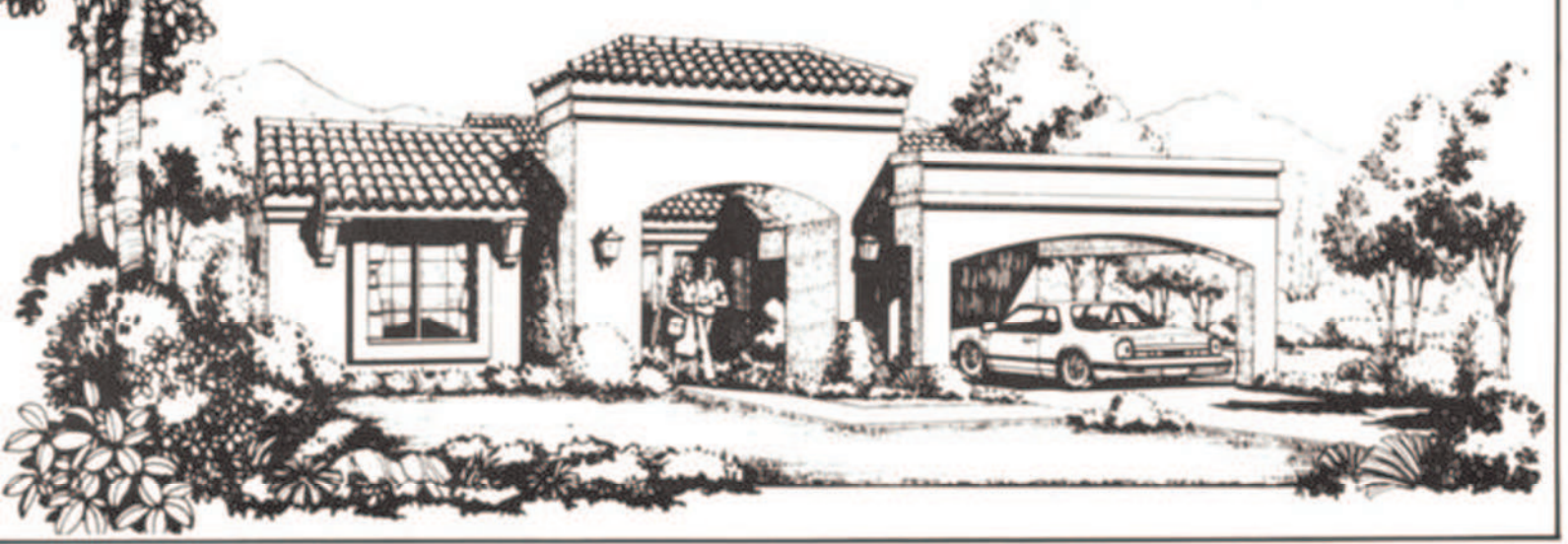
Elev. - A