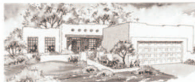
Exterior Design D