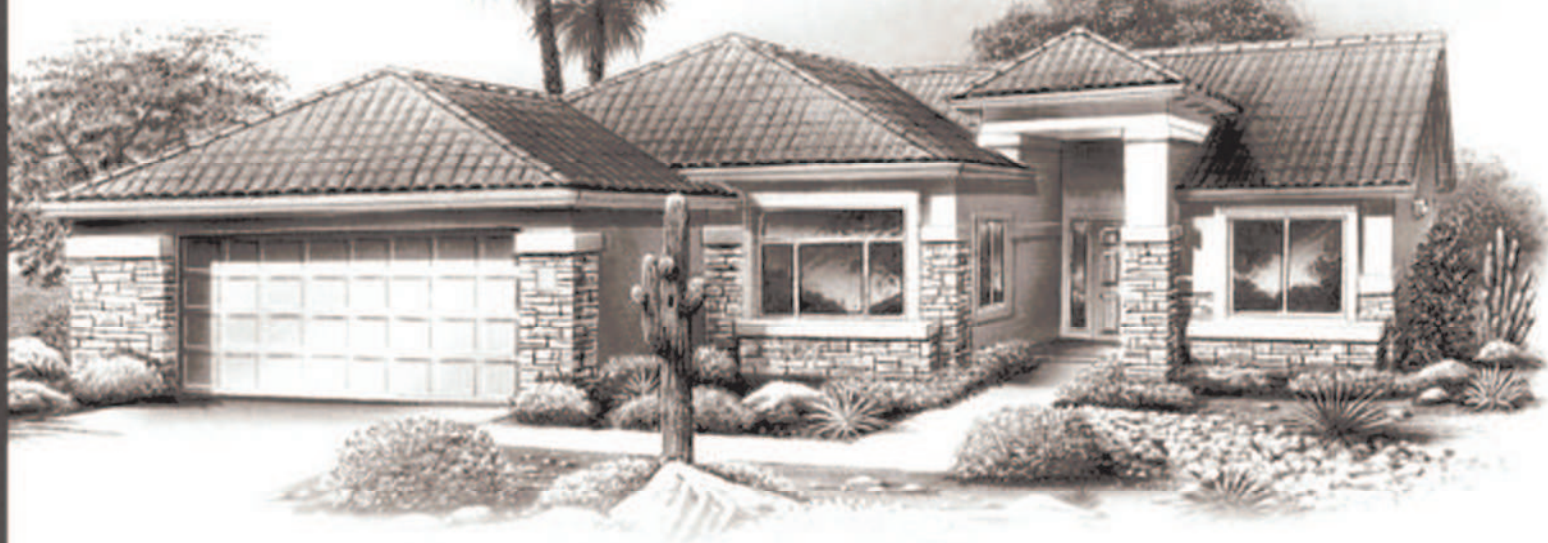
2 Bedrooms, Den (Opt. 3rd Bedroom), 2 Baths, 1826 Livable Sq. Ft. - Exterior Design-C (Opt. Stone) (Please see your New Home Consultant for actual stone placement)