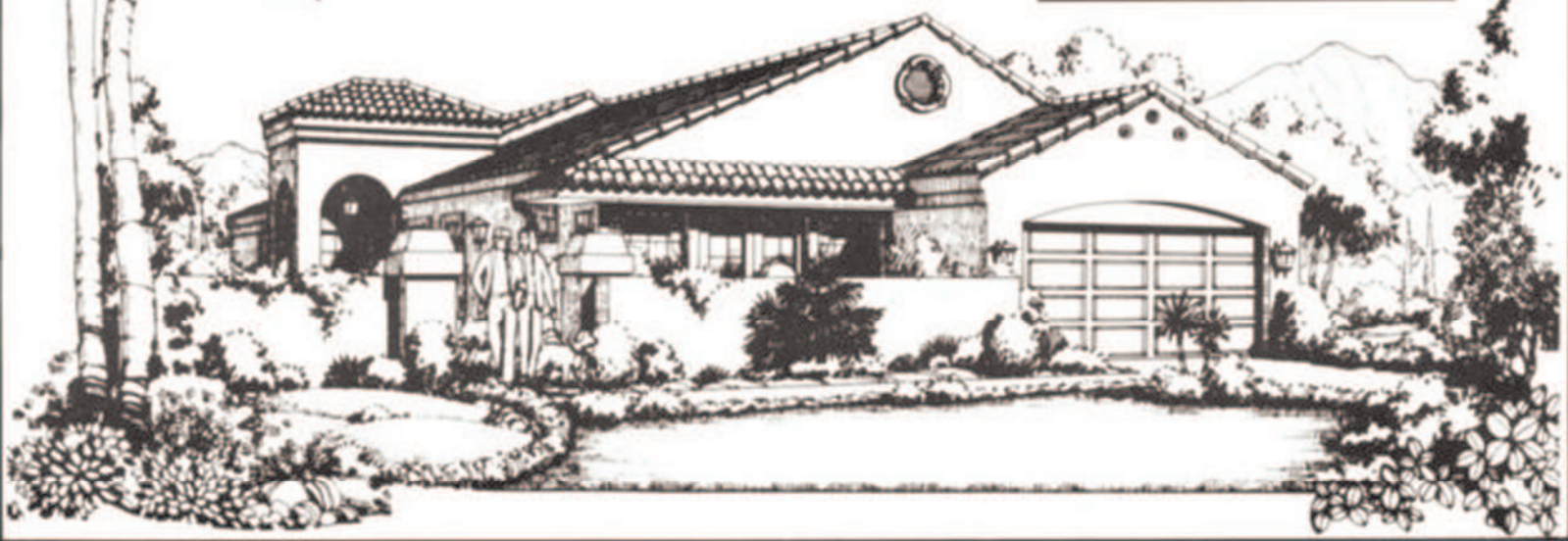
Elev. - A