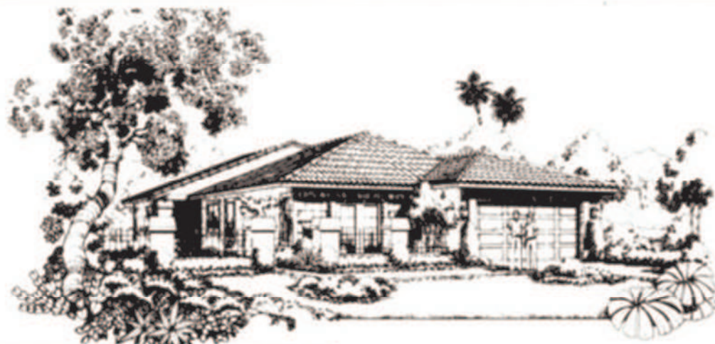
Elev. - B