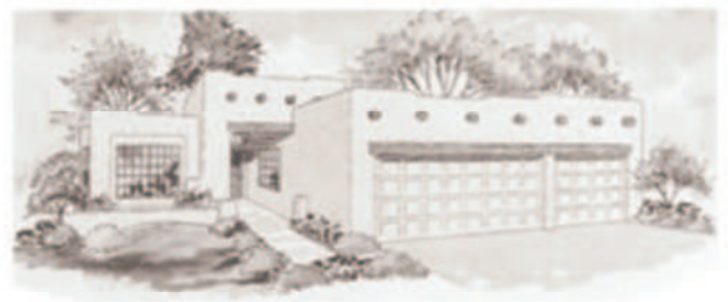
Exterior Design D