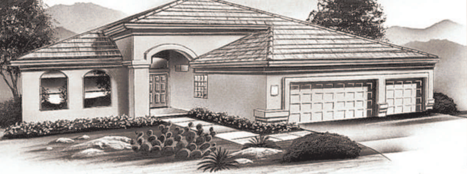
2 Bedrooms, Den, 2-1/2 Baths, 2838 Livable Sq. Ft. - Exterior Design-C